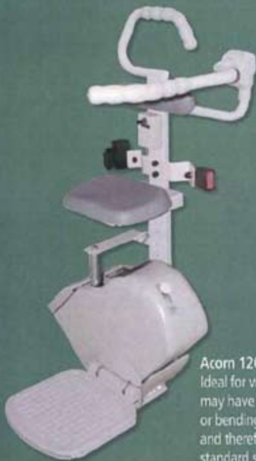
Acorn 120 Perch Stairlift. Ideal for when the user may have trouble sitting or bending at the knee and therefore cannot use a standard stairlift.