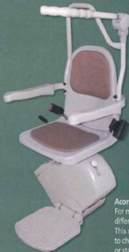
Acorn 120 Sit/Stand Stairlift. For multiple users with different requirements. This model allows the user to choose whether to sit or stand.