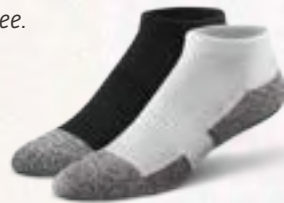
C. No Show Below the ankle.