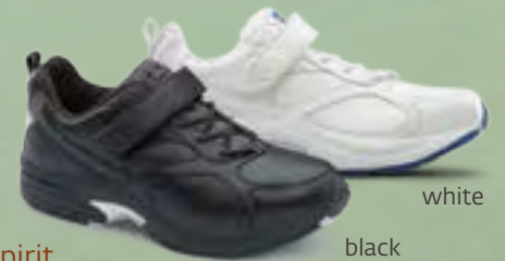
Spirit All leather with Velcro® closure.