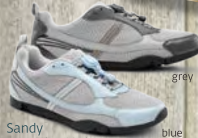
Sandy Women's athletic.