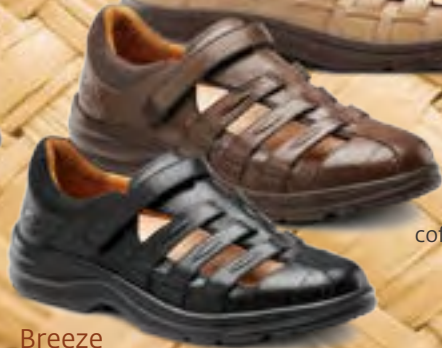
Breeze Open air sandal.