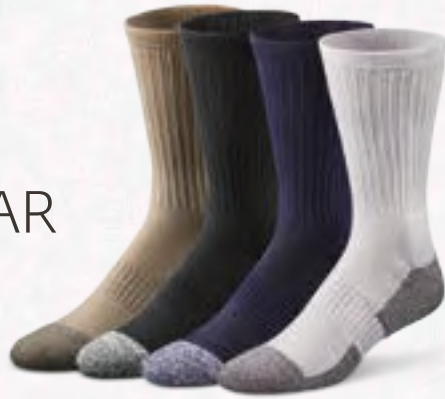
A. Crew Length Our most popular.