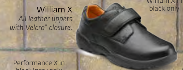
William X black All leather uppers with Velcro® closure.