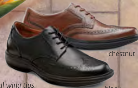
Wing Traditional wing tips.