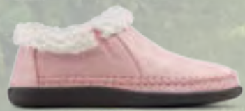
Indoor/Outdoor Slippers! (page 36) The Ultimate in Comfort!