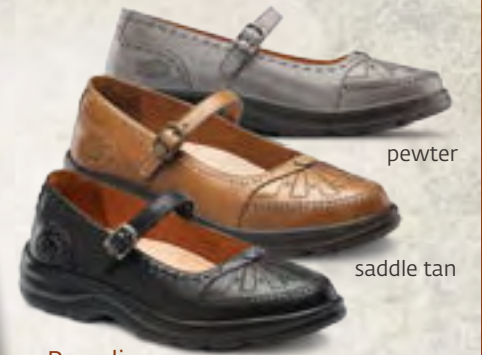
Paradise Intricate stitching. pewter saddle tan black

Sizing for Betsy, Flute, Lu Lu, Paradise and Sunshine