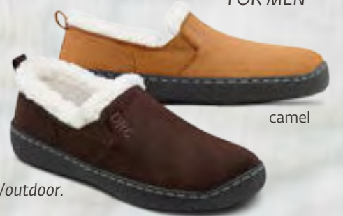
Vista Men's indoor/outdoor.

Women's sizes Width | Size W | 6 - 11 Full Sizes Only