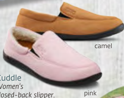
Cuddle Women's closed-back slipper.