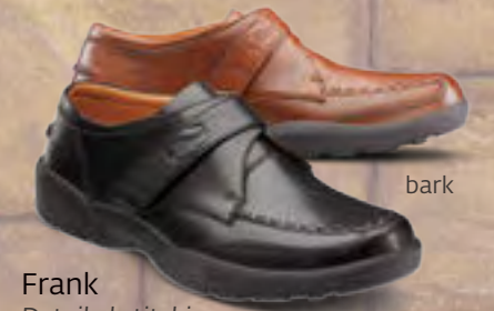
Frank Detailed stitching with Velcro® closure.