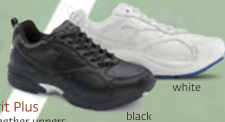
Spirit Plus All leather uppers.