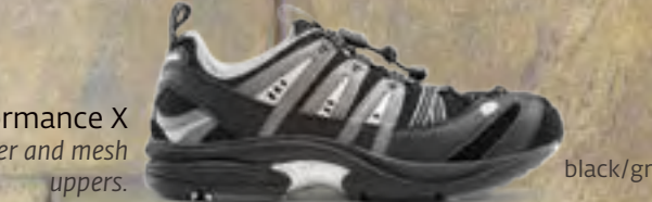
Performance X black/grey Leather and mesh uppers.