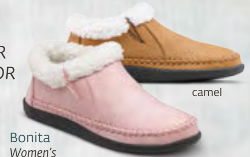
Bonita Women's indoor/outdoor.

Women's sizes Width | Size W | 6 - 11 Full Sizes Only