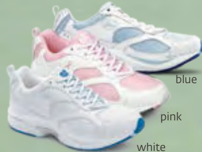
Victory Plus Leather and mesh uppers.