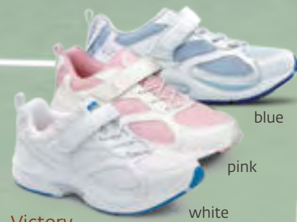
Victory Leather and mesh uppers with Velcro® closure.

Stay active in comfort with the stylish and lightweight athletic wear featured in our Women's Athletic Comfort Collection.