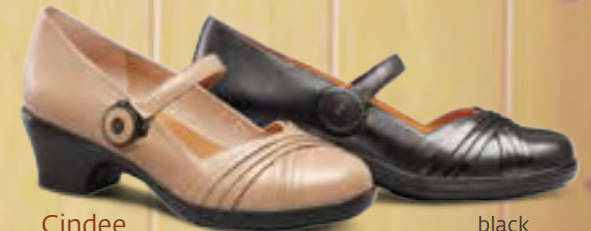
Cindee Classic ribbon design. taupe black