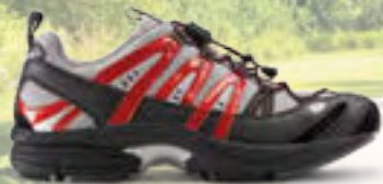
New Colors! (pages 12 and 24) In Performance and Refresh, our most popular athletic styles.