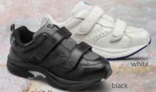
Spirit X All leather uppers with double Velcro® closure.