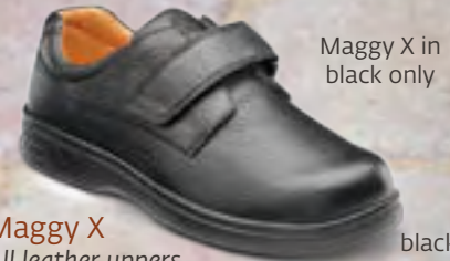
Maggy X All leather uppers with Velcro® closure.