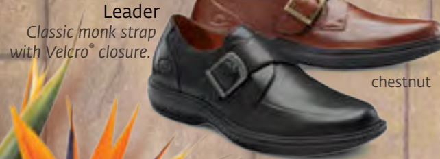
Leader Classic monk strap with Velcro® closure.