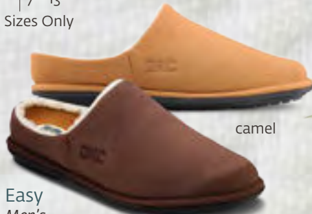
Easy Men's open-back slipper.