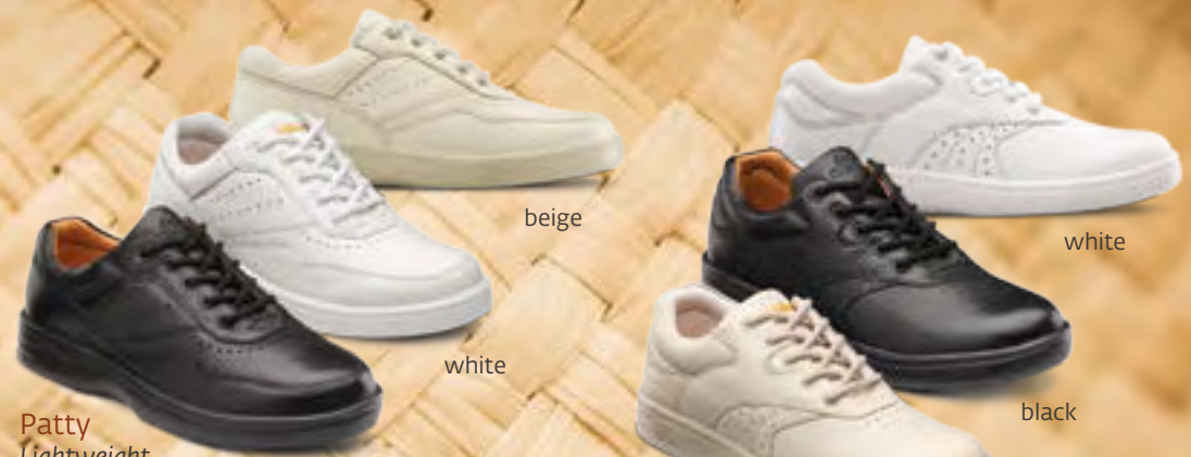
Patty Lightweight walking shoe.