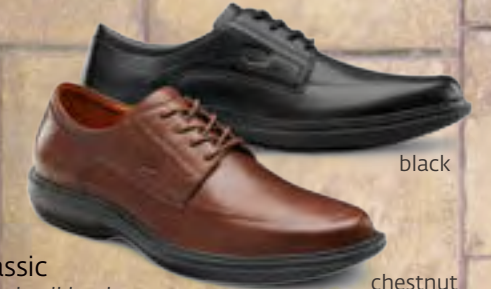
Classic Simple all leather classic.