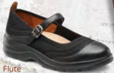
Flute Merry Jane style Lybra®.