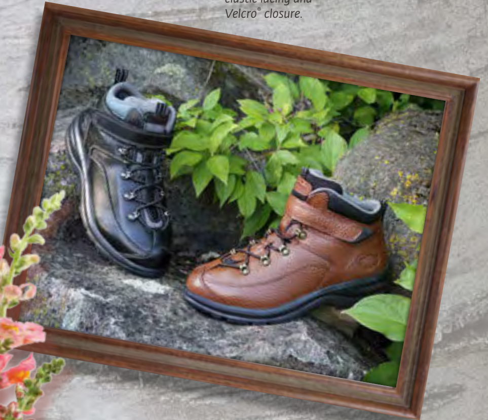
Vigor Lightweight hiker with unique no-tie elastic lacing and Velcro® closure. black