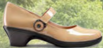
Classic Heels (page 4) YES, it's a diabetic shoe!