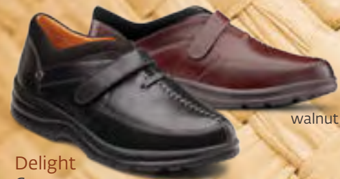
Delight Gorgeous accent stitching.