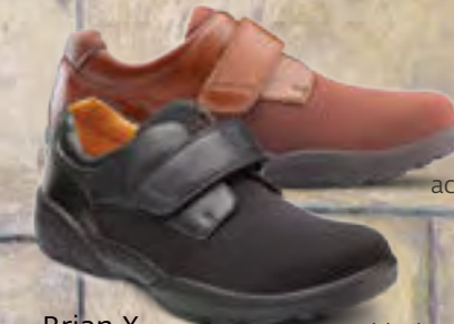
Brian X black Stretch Lycra® with leather trim.