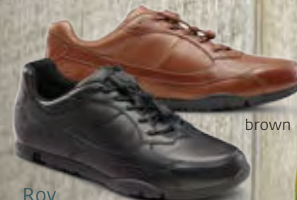
Roy Men's casual.