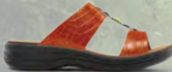
Beautiful Textures! (page 32) Open Comfort with removable footbeds.