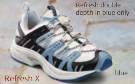
Refresh X Leather and mesh uppers.