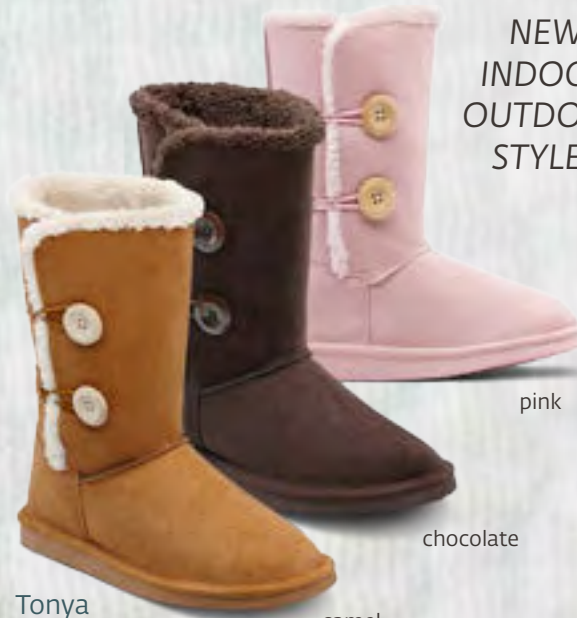
Tonya Stylish women's slipper boot.