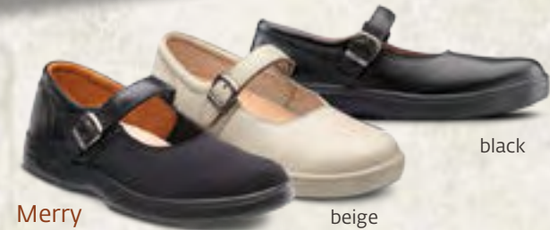
Merry Jane Traditional with Velcro® closure. black beige black Lycra®