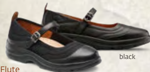
Flute Detailed stitching. black black Lycra®