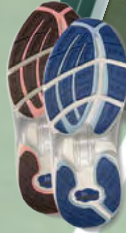
RIGID PLASTIC SHANK

Sizing for Refresh, Spirit, Spirit Plus, Victory and Victory Plus