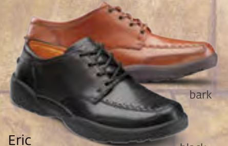
Eric Detailed stitching