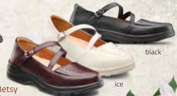
Betsy Gorgeous accent stitching. black ice burgundy