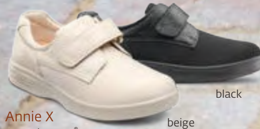
Annie X Stretch Lycra® with leather trim.