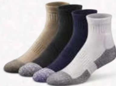
B. Ankle Length Above the ankle.