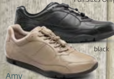
Amy Women's casual.