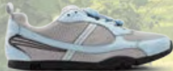
Shoes for your KNEES! (page 30) Flex-OA is clinically proven to reduce load on your knees.