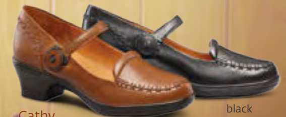
Cathy Hand-stitched accents. brown black