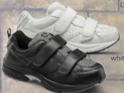
Champion X black All leather uppers with double Velcro® closure.