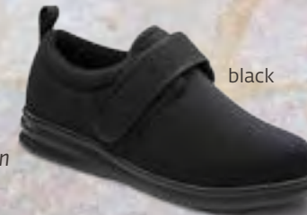
Marla Lycra® washable shoes with Velcro® closure. Available in double depth only.