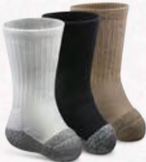
G. Transmet For people with amputations. Each includes one standard size sock.