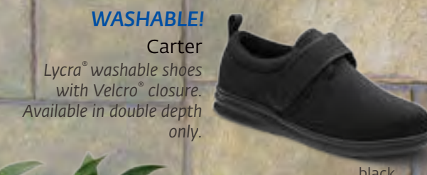
WASHABLE! Carter Lycra® washable shoes with Velcro® closure. Available in double depth only.