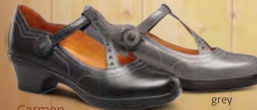
Carmen Detailed stitching. black grey