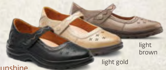
Sunshine Hand-tooled design. black light gold light brown