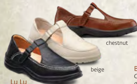
Lu Lu Lightweight Velcro® closure. black beige chestnut