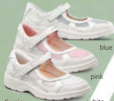
Susie Merry Jane style with leather and mesh uppers.