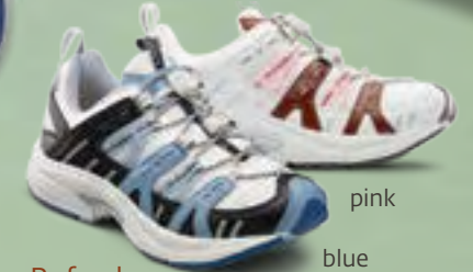
Refresh New Colors!