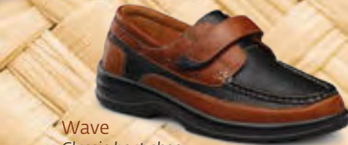
Wave Classic boat shoe.