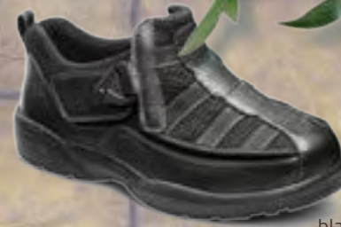
Edward X black Over one inch of Velcro® on each side, the Edward X allows for maximum adjustability to accommodate extra volume. Leather and mesh uppers. Available in double depth only.