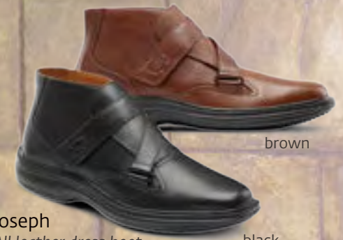
Joseph All leather dress boot with switch-back Velcro® closure.