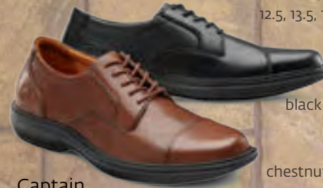
Captain Cap toe design.