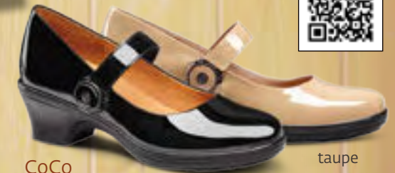
CoCo Rich patent leather. black taupe